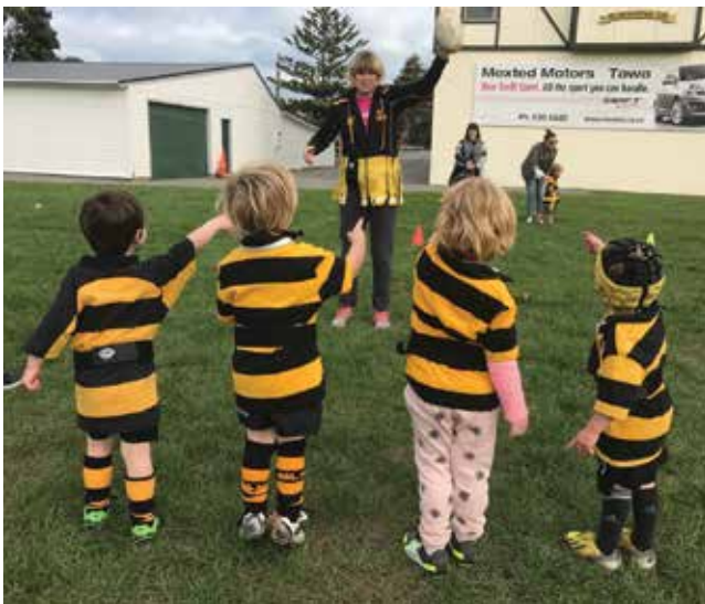
Nursery grade off to flying start.