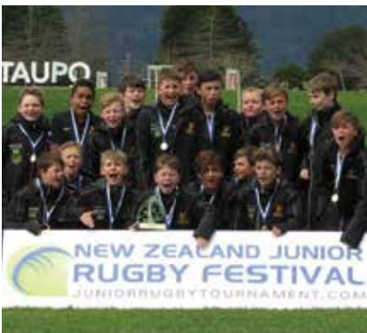
U12's win Taupo.