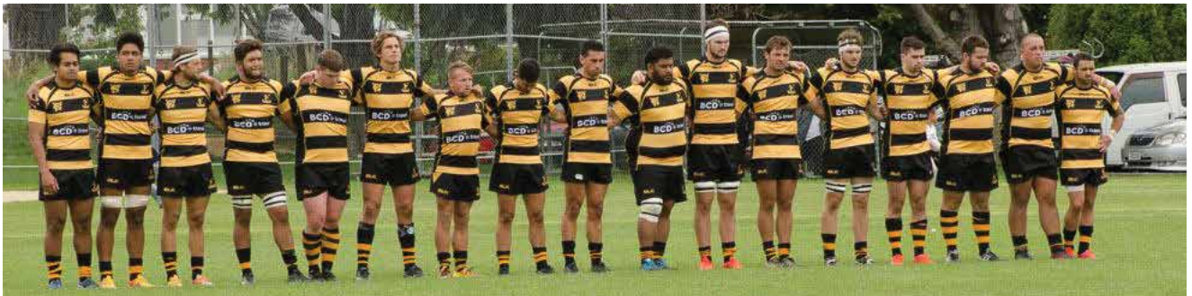
BCD Travel Premiers.

Coming into the Hardham there was another degree of player turnover and ultimately a far more positive atmosphere and consistency of attendance at training was achieved. Further positive performances were hit hard by multiple losses in the last 20 minutes highlighting the lack of fresh bench players. The small squad can be very proud of fulfilling the rigours of the elongated Hardham and those that came through for the club have displayed attitude and vigour we can depend on in the future.