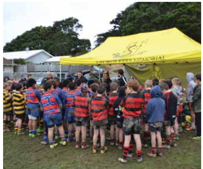
Inaugural Wellington Invitation Cup U10's.