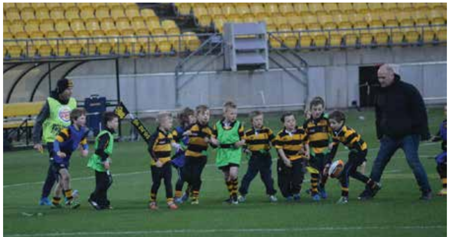
U7's hit Westpac Stadium at half time.