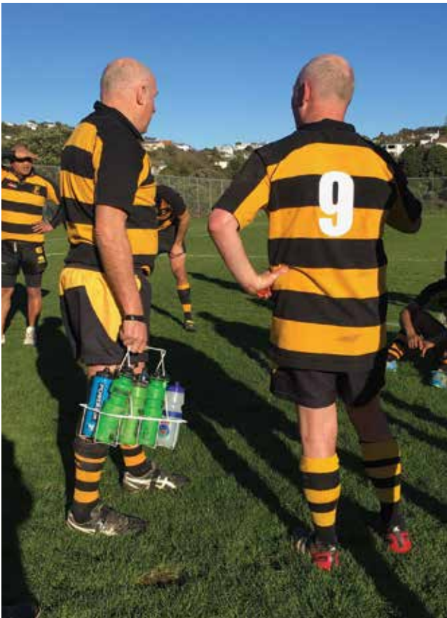
Pressie's discussing tactics.