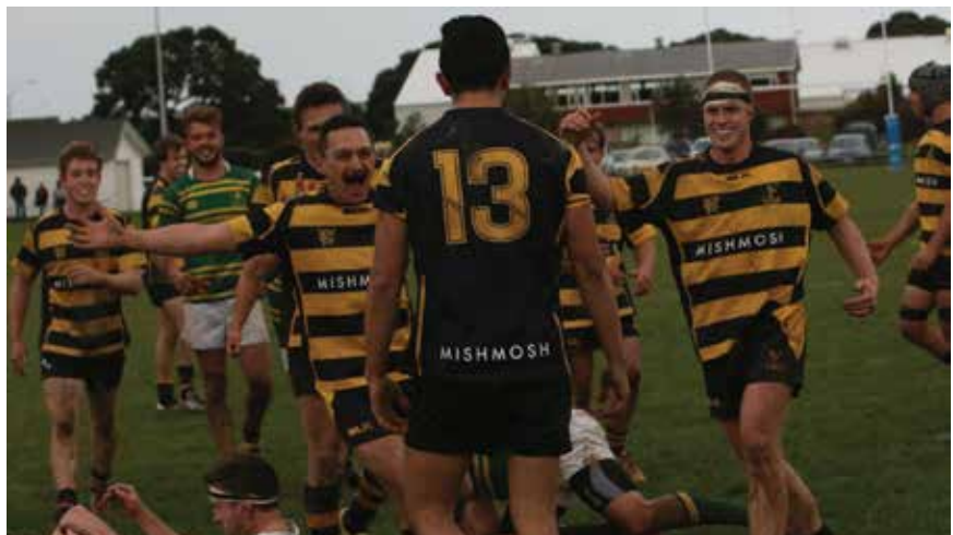
Mish Mosh Under 85s celebrating another try, leading to another win!