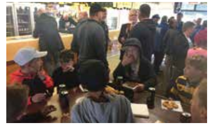
Supporting the Prens, post game feed.

Over the off season we will arrange for the damaged wall in the gym to be fixed and we have had some boys in doing some cleaning in the changing rooms.