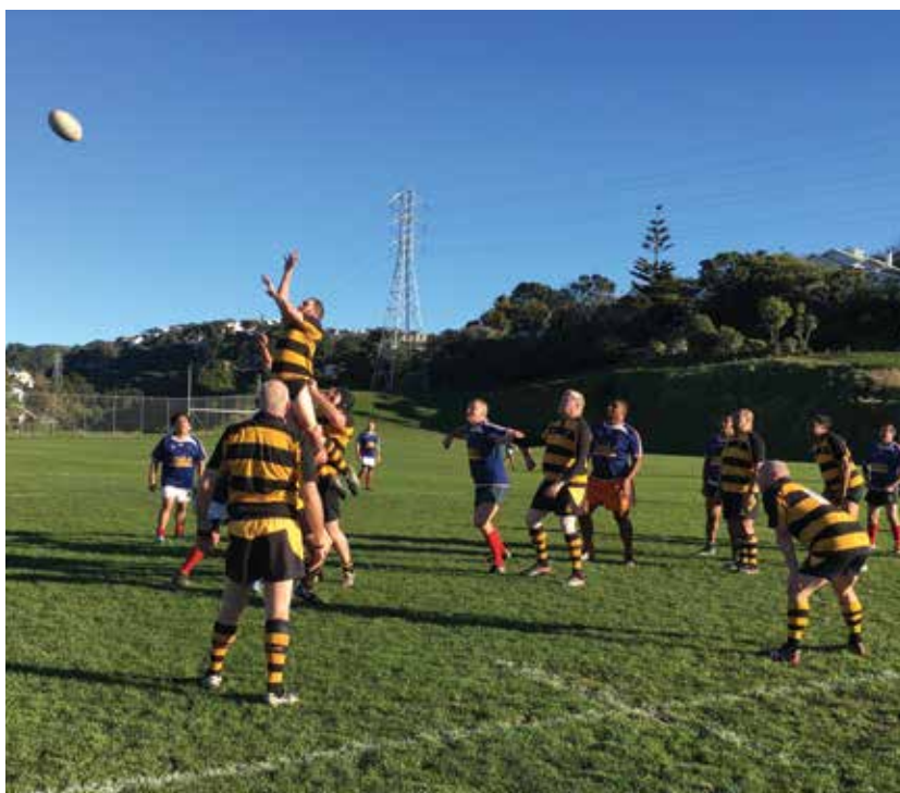
Pressie's playing Wests.