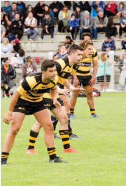
Premiers ready for kick off.