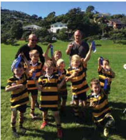
U7's win Wests 7's pre-season.

As a junior committee we have also identified we need to do some major recruitment over the off season to be able to field strong sides across the grades in the coming years. We have identified a lack of rugby holiday and development programs in the region and feel this is a good opportunity to develop a program with the support of our senior club. This would make our club more visible in the rugby arena in Wellington.