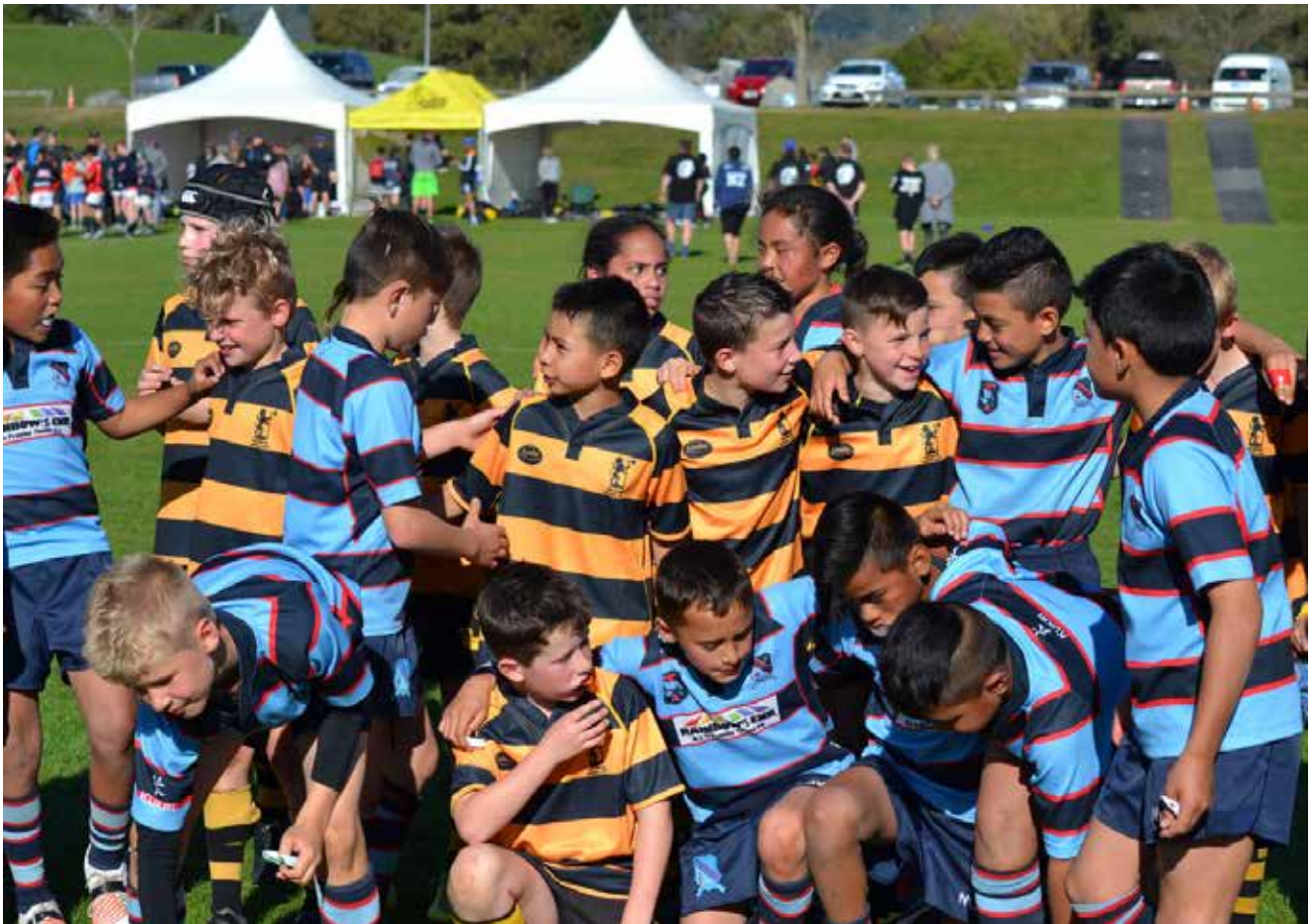
Wellington Under 10's in Taupo.