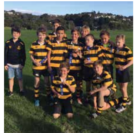
U12's win Wests 7's.